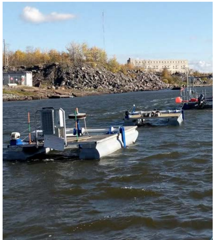
Image: R&D underway by CHTTC.