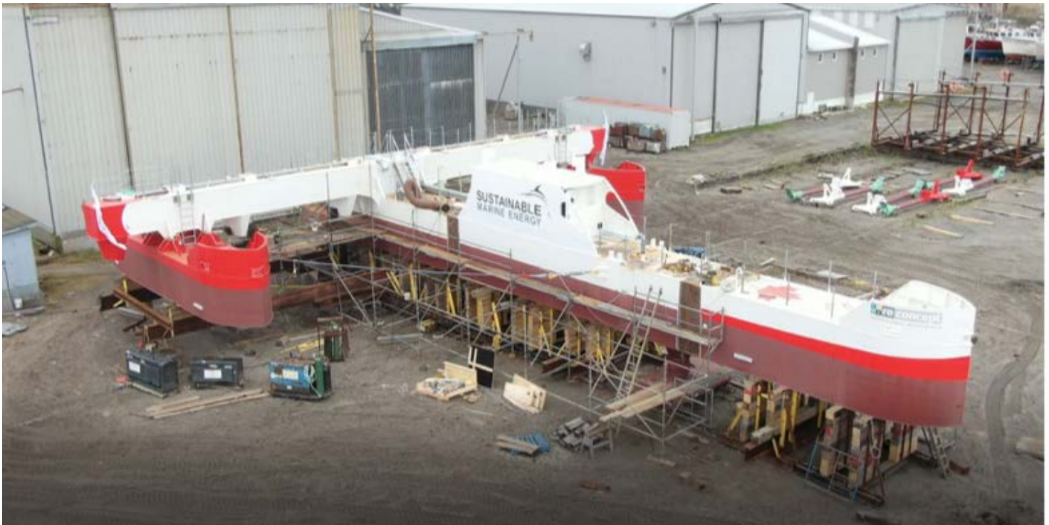
Image: Construction of Sustainable Marine's 420kW PLAT-I platform.

Sustainable Marine has been operating its PLAT-I 4.63 (280kW) floating tidal energy platform in Grand Passage since 2018. The demonstration has provided the opportunity to collect useful data, test operations and maintenance methods, and support important environmental and technical R&D. In late 2020, Sustainable Marine was awarded $28.5 million by the Government of Canada for the development of its 9MW Pempa'q project at FORCE. The first phase of the Pempa'q In-stream Tidal Energy Project will begin with the installation of a 420kW PLAT-I platform that will be launched in early 2021. It will be installed at the Grand Passage site for commissioning and testing throughout the winter and spring. Construction work will then start at FORCE where this platform will be installed, alongside two others, to provide a combined capacity of 1.26MW.