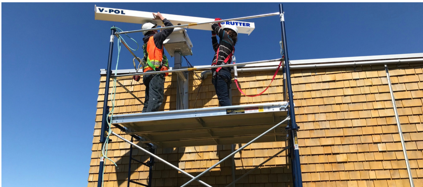
Image: FORCE installed a new radar at the visitor centre in 2020 as part of the Risk Assessment Program (RAP) for tidal stream energy, replacing the previous model which had been in operation since 2015. The new radar, along with another unit at the Cape Sharp Lighthouse, will build a high-resolution radar network to create the first spatiotemporal flow atlas of the Minas Passage and deliver real-time hydrographic mapping of currents, eddies, and waves—important determinants of marine animal distribution.