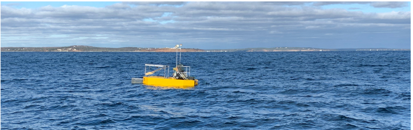
Image: Demonstration of Oneka's newly developed system, P1, Nova Scotia.