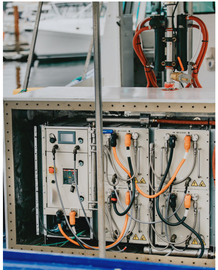
Image: The Alutasi - a vessel now converted from diesel to hybrid electric using a lithium-ion battery.