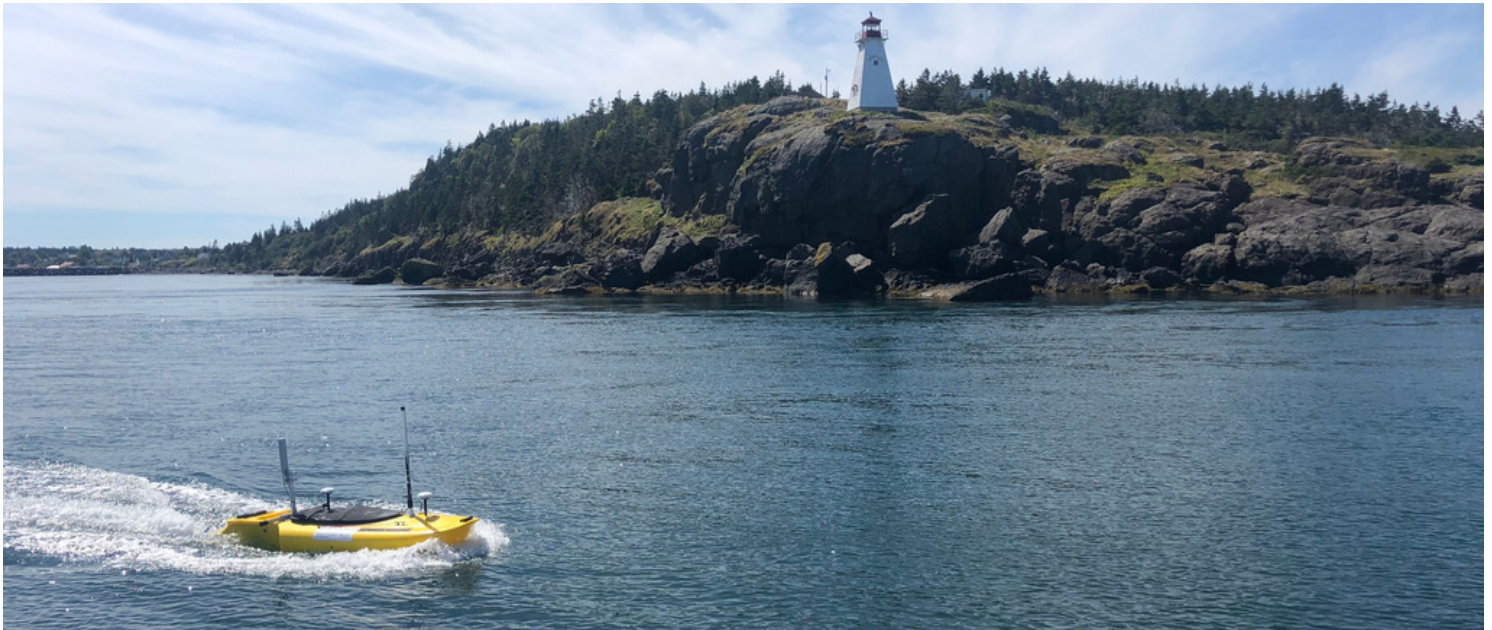
Image: Jetyak in Petit Passage for an OERA funded project - a collaboration between Luna Sea Solutions, Dalhousie Ocean Acoustics Laboratory, and Memorial University to develop and validate software for detecting fish using Acoustic Doppler Current Profilers (ADCP).

CanmetENERGY-Ottawa is developing methods for identifying areas of high river hydrokinetic potential in river reaches across Canada through remote sensing techniques. In partnership with the Canadian Center for Remote Sensing (CCRS), CHTTC, University of Ottawa, and NRC, CanmetENERGY analyzes Synthetic Aperture Radar (SAR) and Optical Satellite data to locate areas of open water within river ice. These areas are indicative of high kinetic energy in the form of turbulence or velocity and may be suitable for energy extraction. The ultimate goal of this project is to create a publicly available database of high potential sites to be leveraged by project developers and remote communities for potential renewable energy projects. Initial SAR datasets from the Radar Constellation Mission (RCM) have been analyzed and field validations of the findings are ongoing.