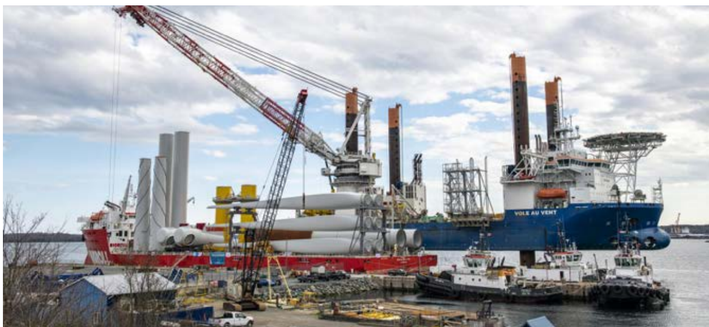
Image: Roll Group's Bigroll Beaufort vessel, Jan De Nul's Vole au Vent Installation vessel, and Atlantic Towing's harbour tugs involved in the delivery of offshore wind components to Woodside/Port of Halifax, Nova Scotia for the Coastal Virginia Offshore Wind project.

Canadian suppliers are also supporting international offshore wind development and in addition to this, some international work has been completed in Canada. For example, in Spring 2020, Dominion Energy and Ørsted delivered turbine components and monopiles to Woodside (Port of Halifax) in Dartmouth, Nova Scotia before they were loaded on the installation vessel, Vole au Vent, for the 12 MW Coastal Virginia Offshore Wind (CVOW) pilot project. This work arose from limitations due to the US Jones Act which requires that any transport of goods between US ports to be done on US built, crewed and flagged ships. Currently, there are no US offshore wind installation vessels, which creates an opportunity for Canadian ports in close proximity.