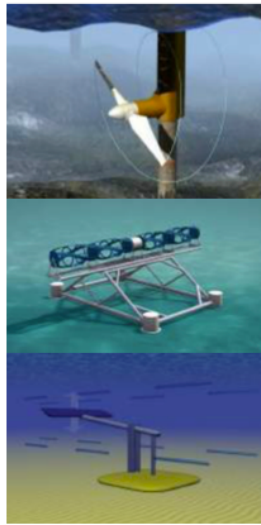
FIGURE 2. ROTOR TYPE DESIGN ALTERNATIVES [13-15].

the social and environmental benefits of novel designs against their technological maturity and cost.