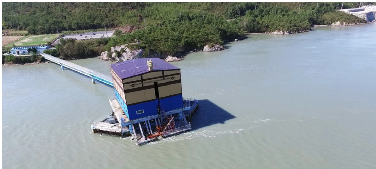
Uldolmok Tidal Power Station

KIOST is also developing a tidal current energy converter (TEC) hybrid system for remote off-grid islands utilizing dual vertical axis Darrius turbines with a rated power of 100 kW. For accumulating electricity, the energy storage system (ESS) has a total capacity of 500 kWh. This hybrid system was manufactured and installed at the front side of the existing Uldolmok Tidal Power Pilot Plant to be tested in 2023.