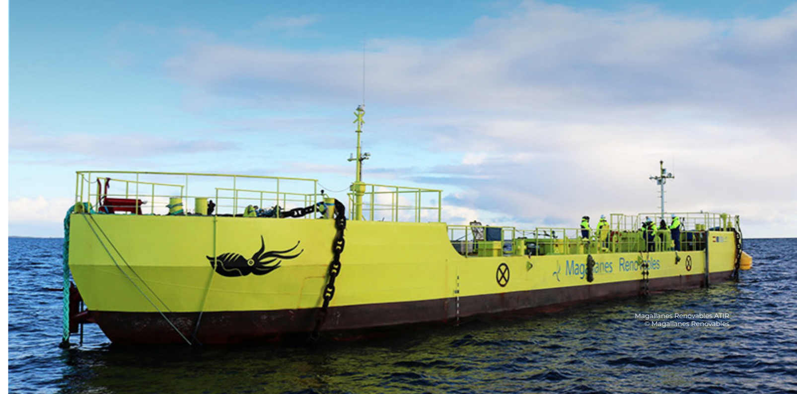
Magallanes Renovables ATIR

Magallanes was among the three tidal turbine developers to receive a Contract for Difference (CfD) in the UK government's latest auction round, paving the way for their first commercial deployment at the Morlais project in Anglesey, Wales. Onshore construction is now underway.