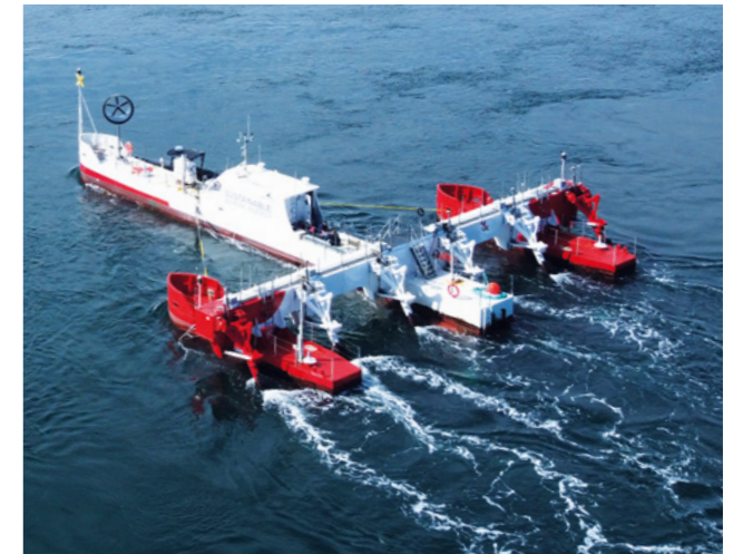
Sustainable Marine's PLAT-I 6.4 in Grand Passage, Nova Scotia

The company has developed an advanced environmental monitoring system, completed the manufacture of the first rock anchors that will be used to secure the device at the FORCE site, and completed construction of the Tidal Pioneer, an advanced inshore construction vessel that is now operating and will be used to perform complex tasks for the high-flow site at FORCE.