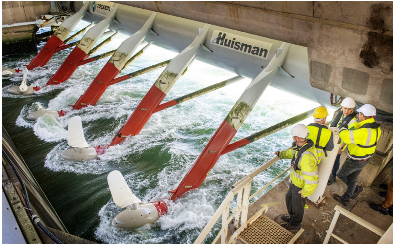
Tocado's Oosterschelde Tidal Power Plant

Tocado's Oosterschelde Tidal Power Plant (OTP) is located in one of the openings of the Oosterschelde Storm surge barrier. It consists of a 50 m long structure with five T2 turbines of 250 kW, with a total installed capacity of 1.2 MW. Commissioning was completed in 2016 and the project, during 2022, continued operations successfully.